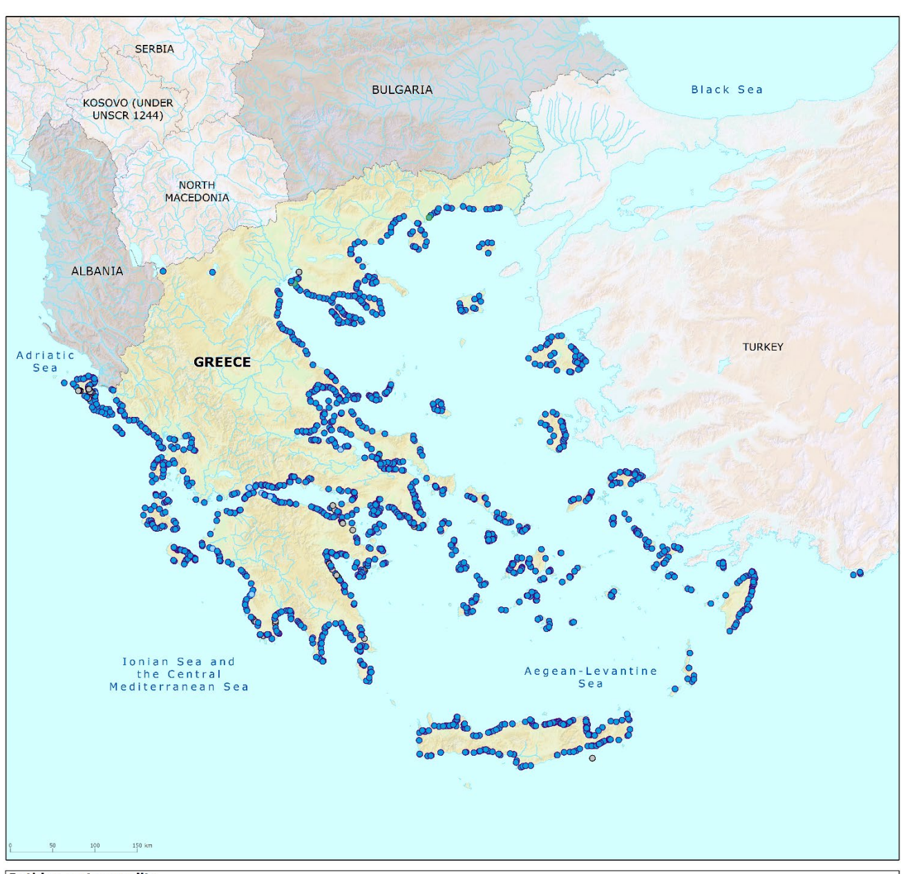
Map 1: Bathing waters reported during the 2022 bathing season in Greece